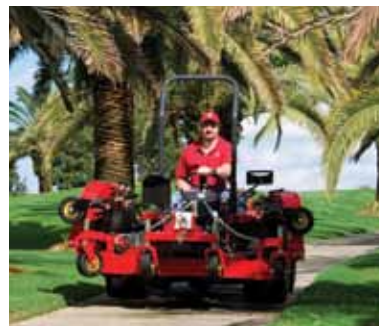
Raises for transport up to 18" (457mm) from ground